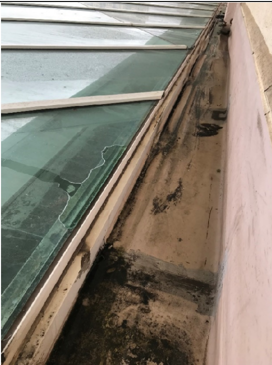
EXTERIOR: CONDITION SKYLIGHT VARIES PHOTO 003