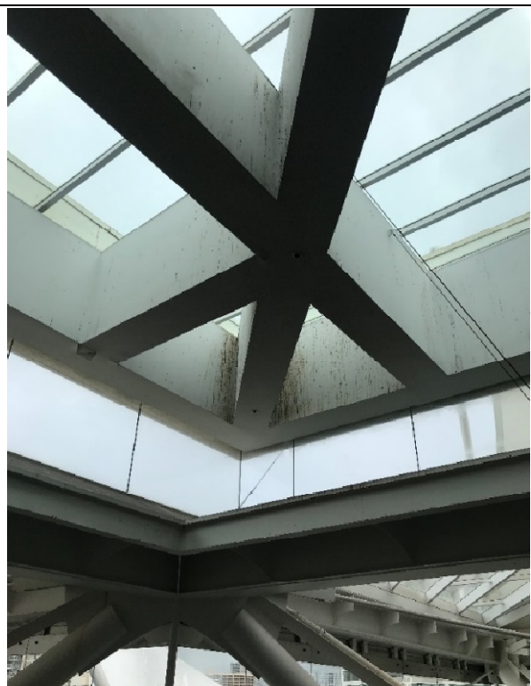
INTERIOR: CONDITION AT PUMP ROOM VARIES 008