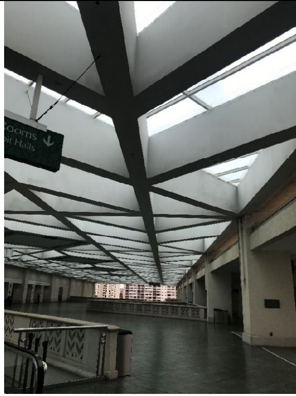
INTERIOR: CONDITION SKYLIGHT VARIES PHOTO 006