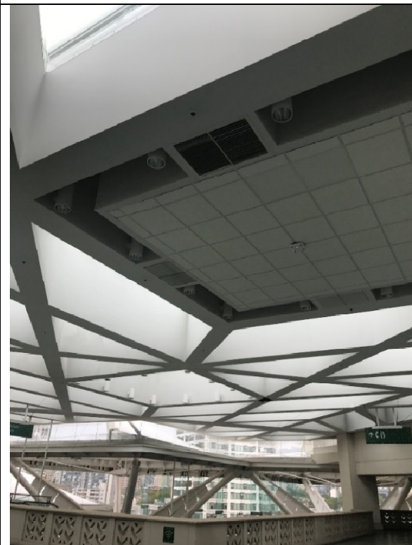
INTERIOR: CONDITION SKYLIGHT VARIES PHOTO 007