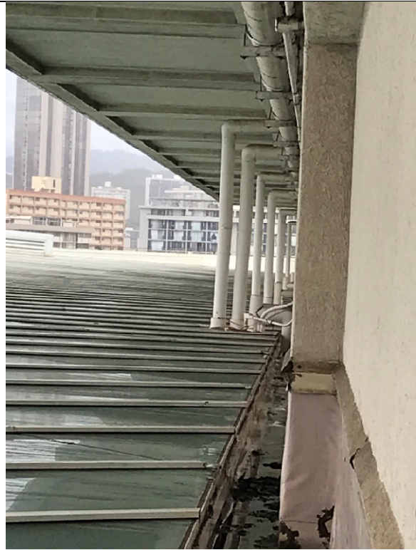
EXTERIOR: CONDITION SKYLIGHT VARIES PHOTO 002