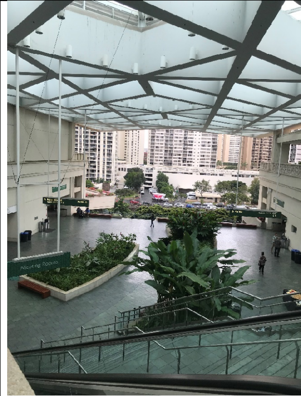
INTERIOR: CONDITION SKYLIGHT VARIES PHOTO 005