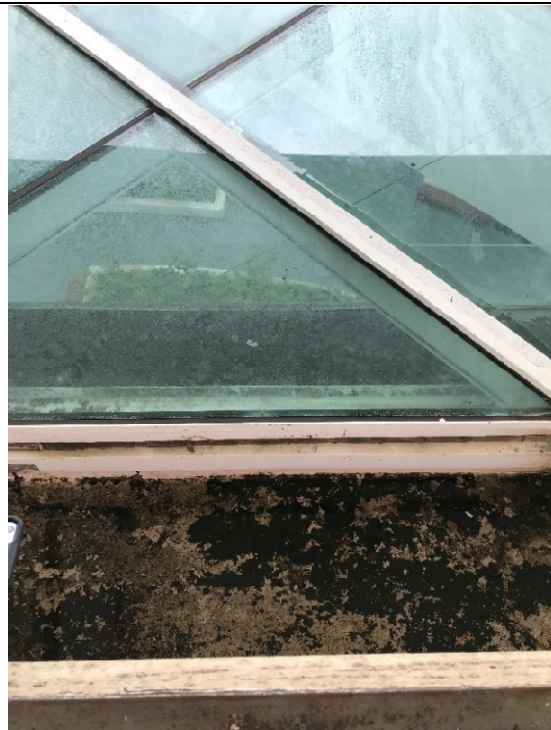
EXTERIOR: CONDITION SKYLIGHT VARIES PHOTO 004