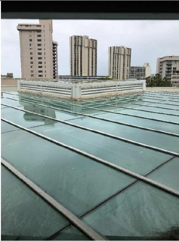
EXTERIOR: CONDITION SKYLIGHT VARIES PHOTO 001