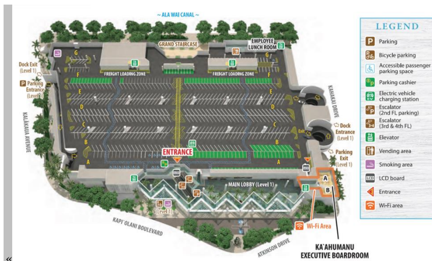
Parking Level Overview 1

(Identify or describe, if appropriate, size, location, dimensions, or other pertinent information, such as geotechnical reports; site, boundary and topographic surveys; traffic and utility studies; availability of public and private utilities and services; legal description of the site; etc.)