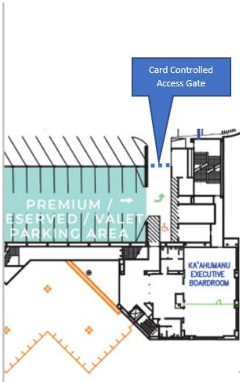
Access Gate Location