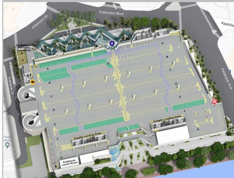
Parking Level Overview 2